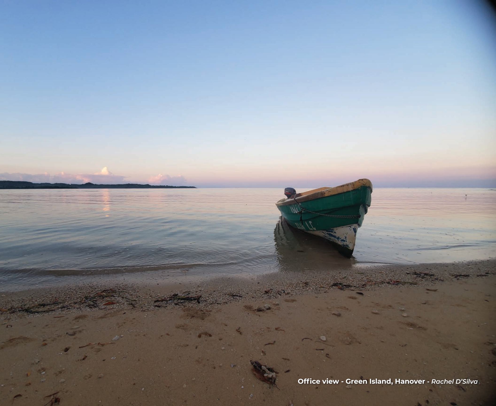
Office view - Green Island, Hanover - Rachel D'Silva