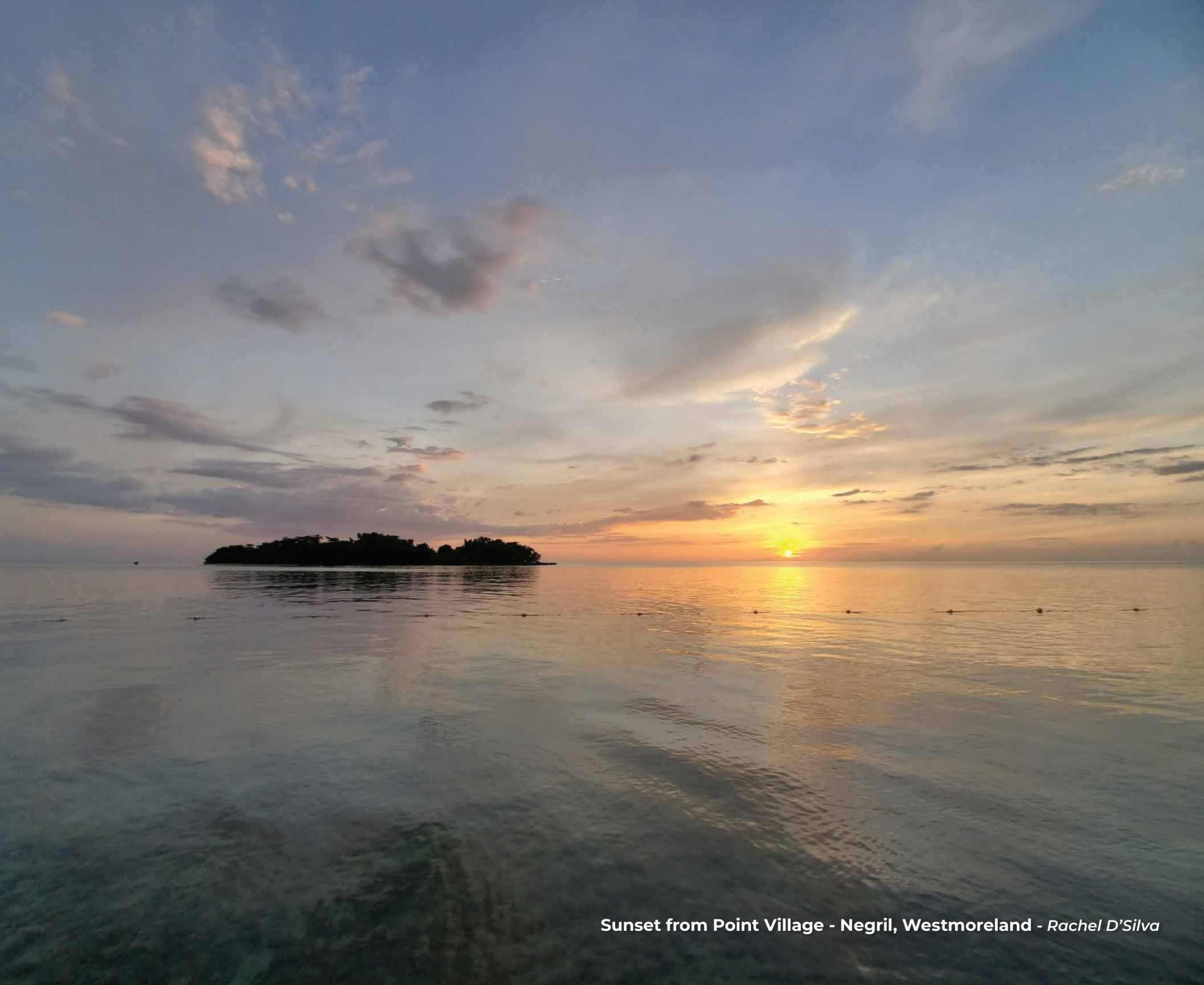
Sunset from Point Village - Negril, Westmoreland - Rachel D'Silva