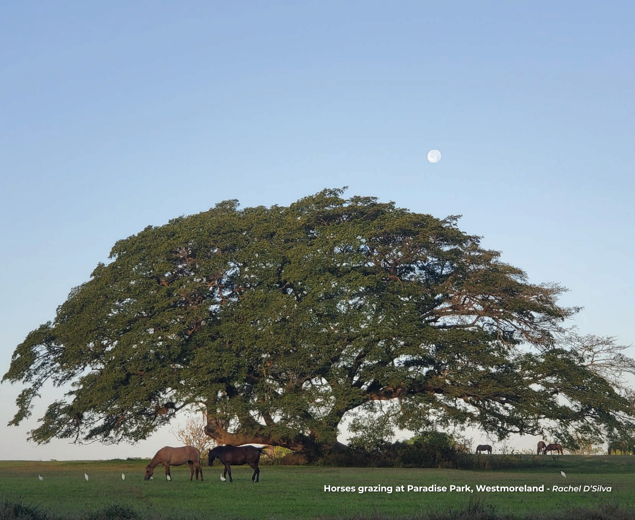
Horses grazing at Paradise Park, Westmoreland - Rachel D'Silva