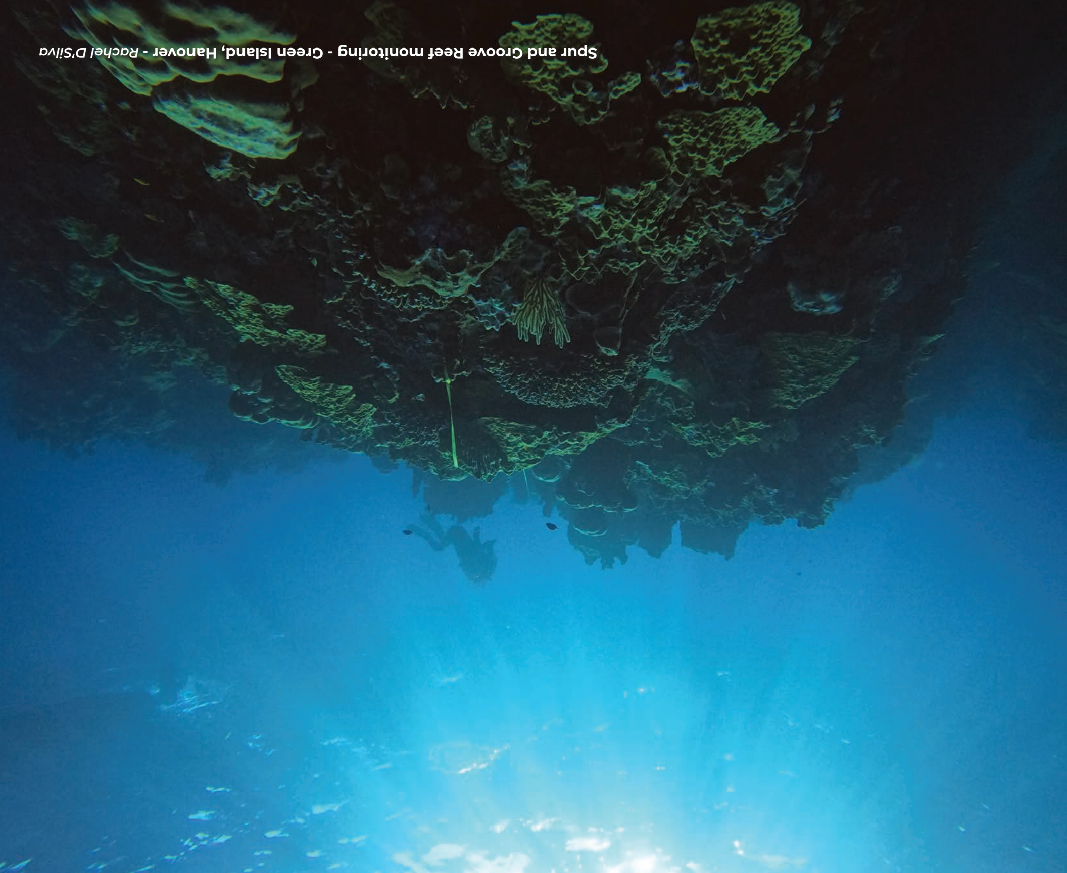
Spur and Groove Reef monitoring - Green Island, Hanover - Rachel D'Silva