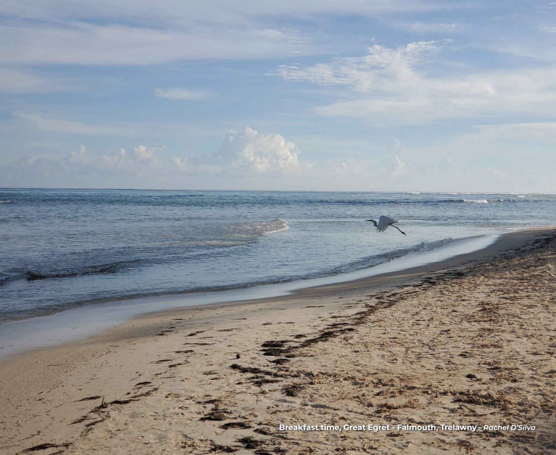
Breakfast time, Great Egret - Falmouth, Trelawny - Rachel D'Silva