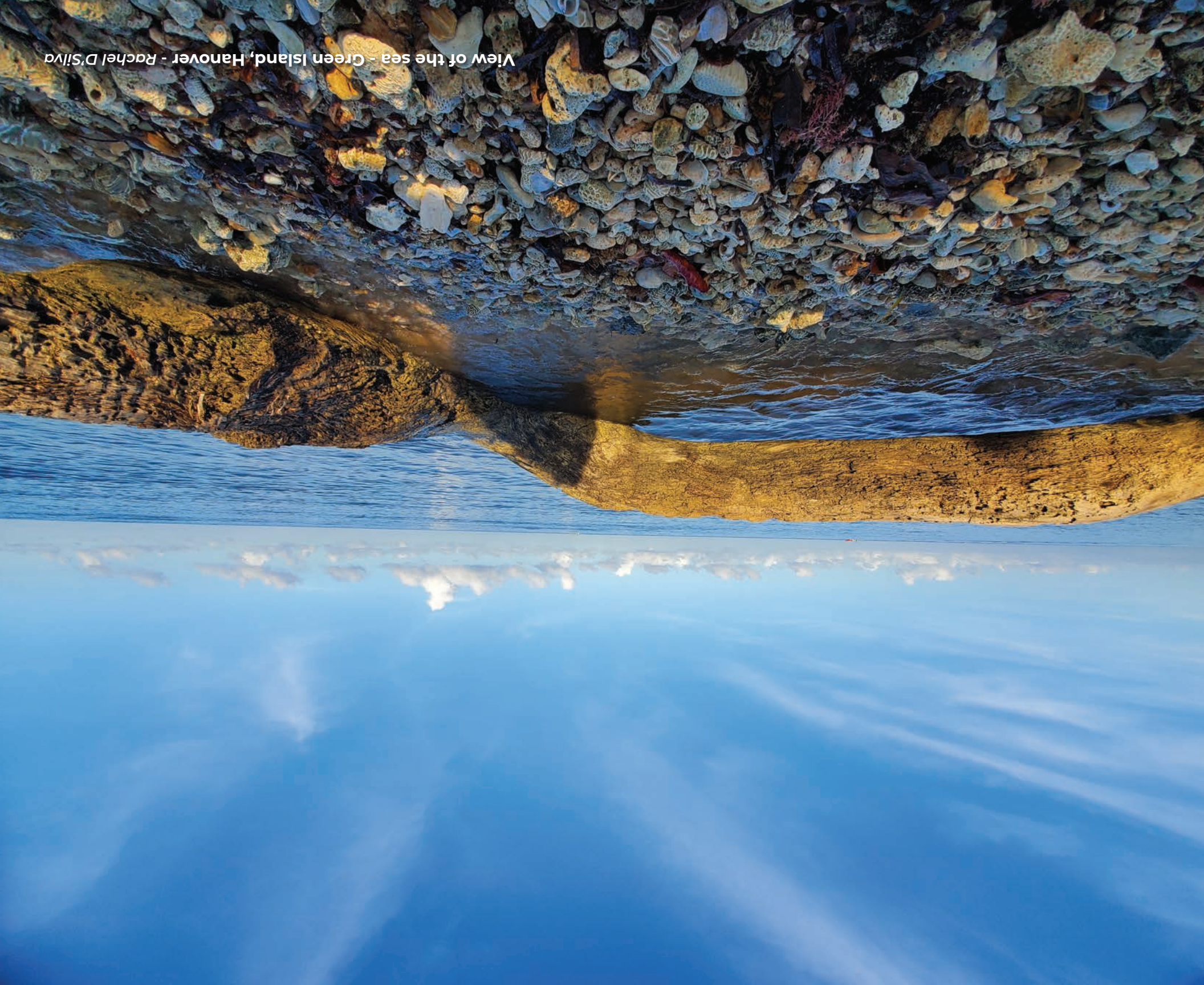
View of the sea - Green Island, Hanover - Rachel D'Silva